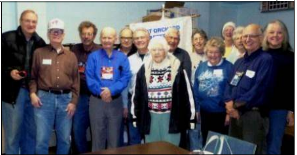
Jan 2011 NARFE Chapter 888 officers & committees NARFE Guardian of your Federal Benefits

With the continuing disproportionate targeting of the federal ↑